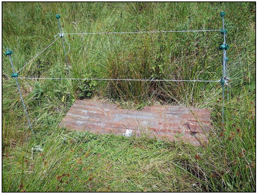
Protecting a refuge from grazing animals by use of a dummy electric fence