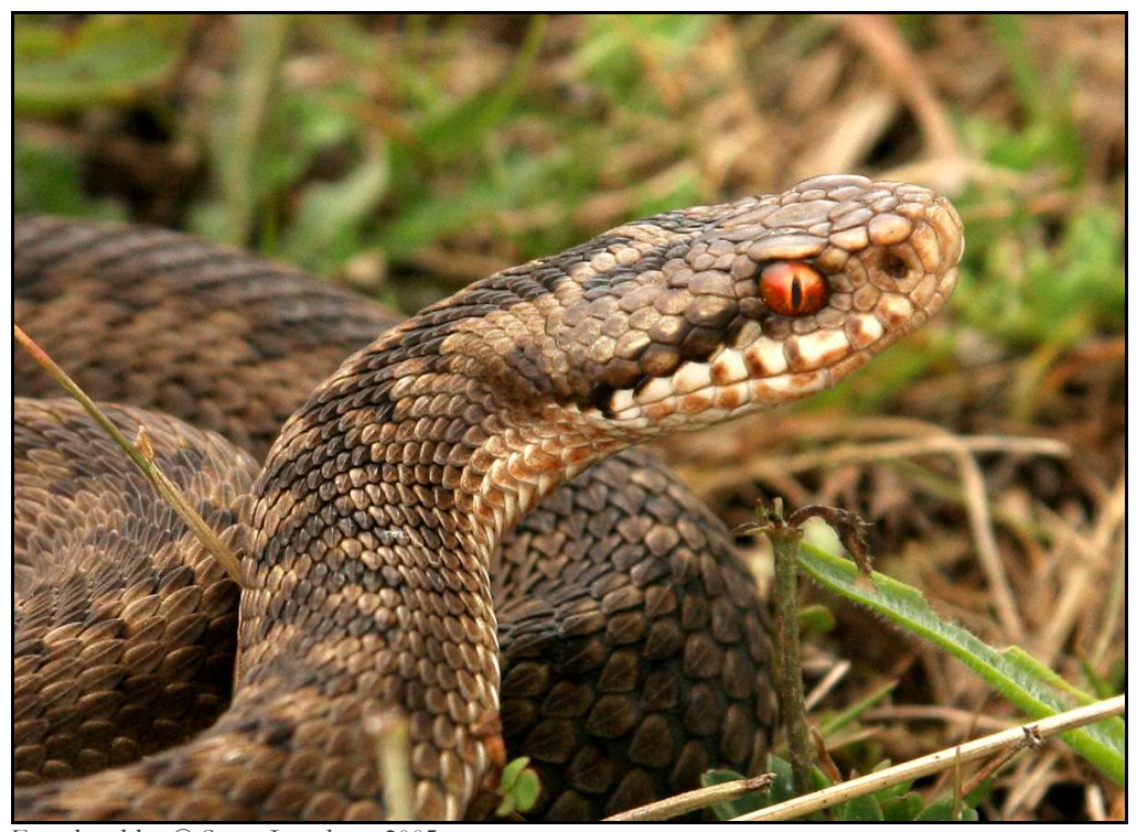
Female adder

2.1. SARG never establishes reptile survey infrastructure without explicit permission from the land owner or land manager.